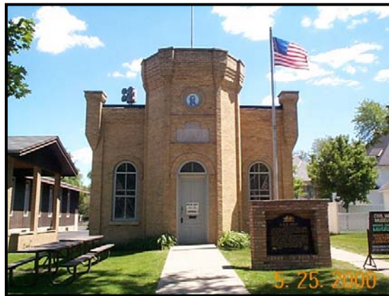
The GAR Hall in Litchfield, Minnesota For more info, visit www.garminnesota.org