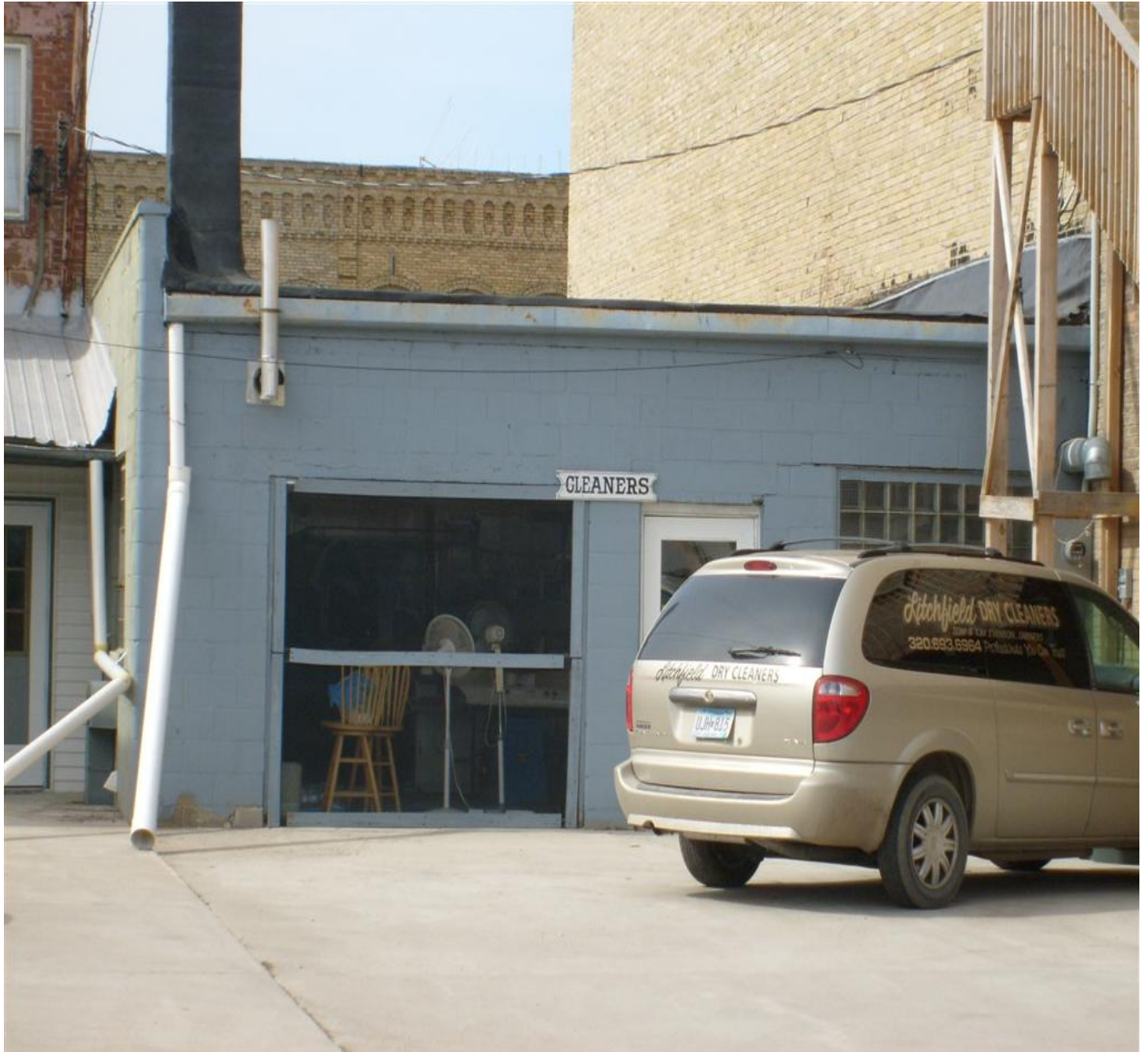
Facing west March 2009