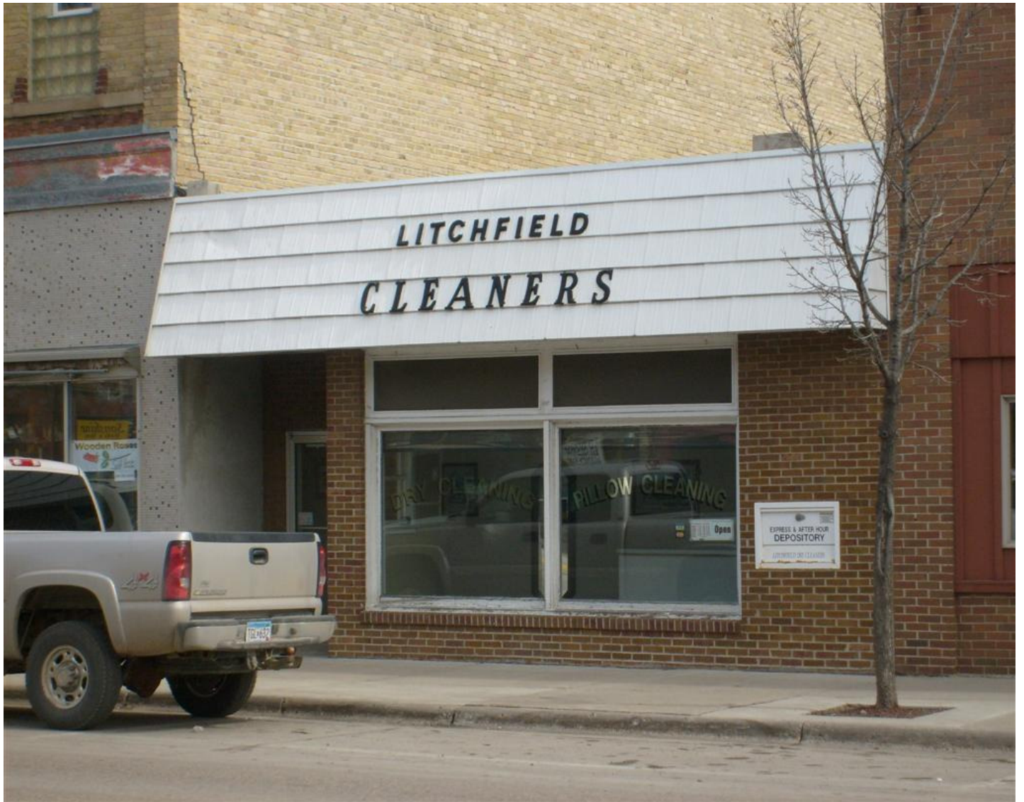
Facing east March 2009